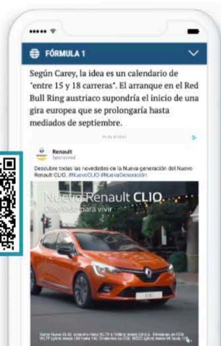
inRead Social Video 15"